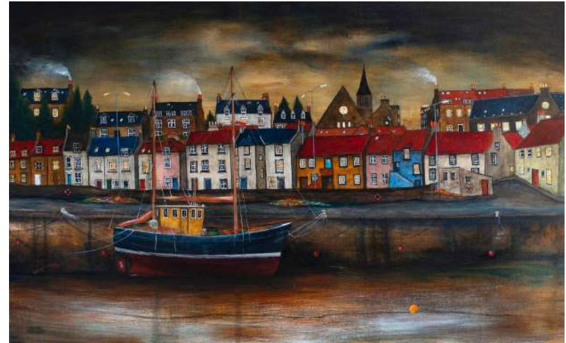
St Monans , Acrylic on board, Framed, £2,950