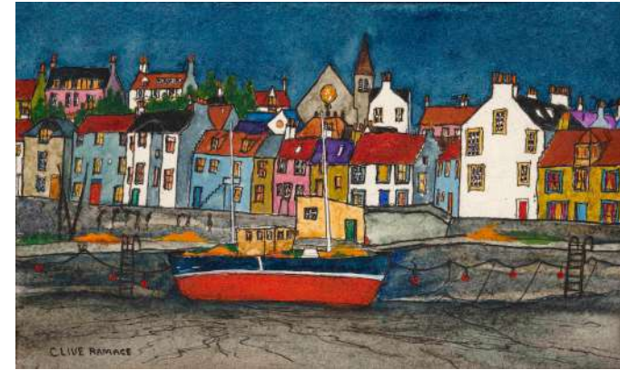
St Monans (Blue & Red Boat), Hand coloured Etching, Framed, £450