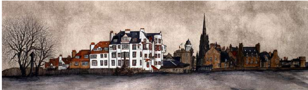
Ramsay Garden, Hand coloured Etching, Framed, £750