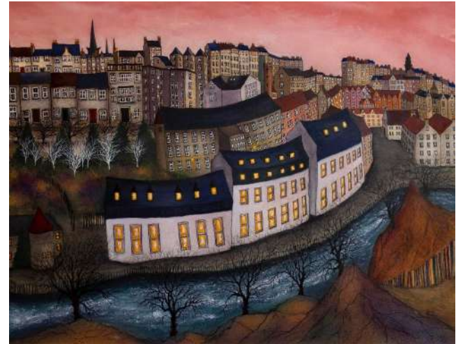
Dean Village, Sunset (Pink Sky), Watercolour & Gouache, Framed, £1,900