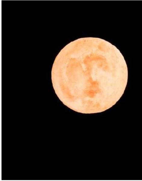
Harvest Moon, Etching, Unframed, £515