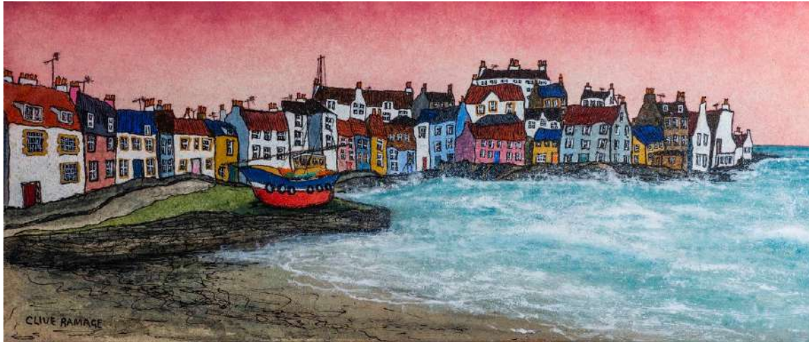
St Monans Harbour (Sunset), Hand coloured Etching, Framed, £550