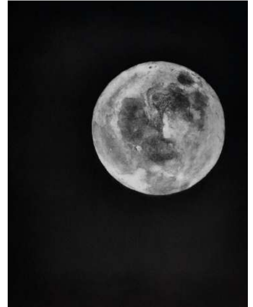
Super Moon , Etching, Framed, £595