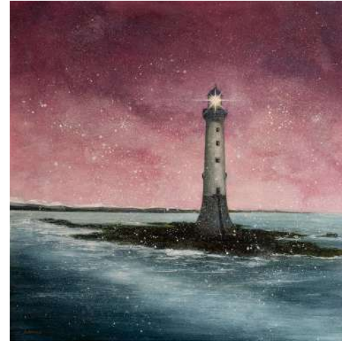
The Bell Rock (Snowfall), Oil on board, £1295