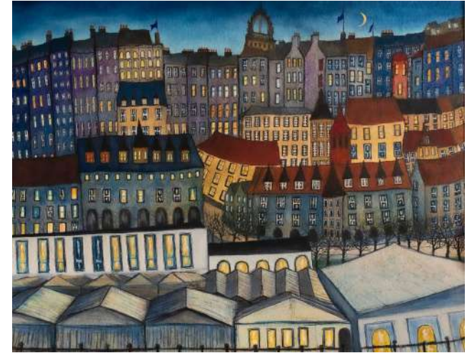
The Old Town, Twilight, Hand coloured Etching, Framed, £1,650