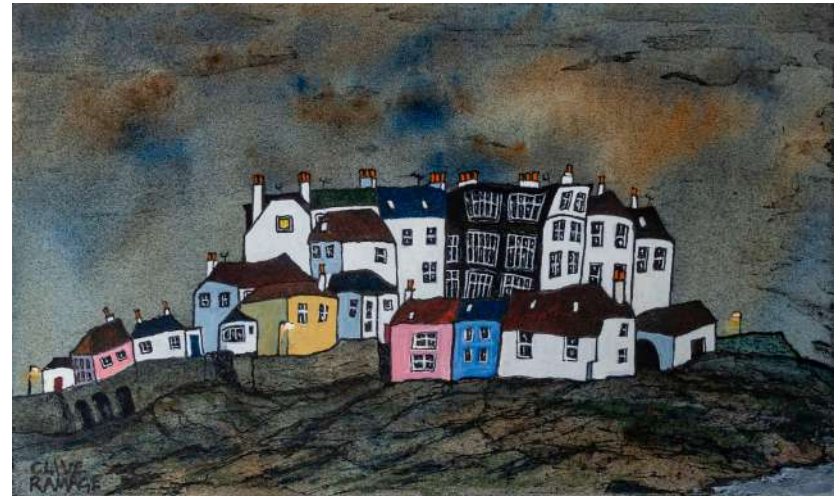
East Neuk 2, Hand coloured Etching, Framed, £425