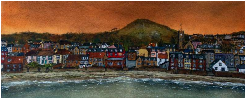
St Monans (Blue & Red Boat), Hand coloured Etching, Framed, £450