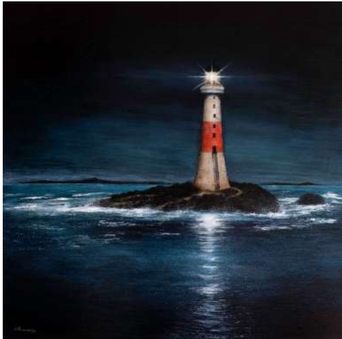
Dubh Artack Lighthouse, Oil on board, £1195