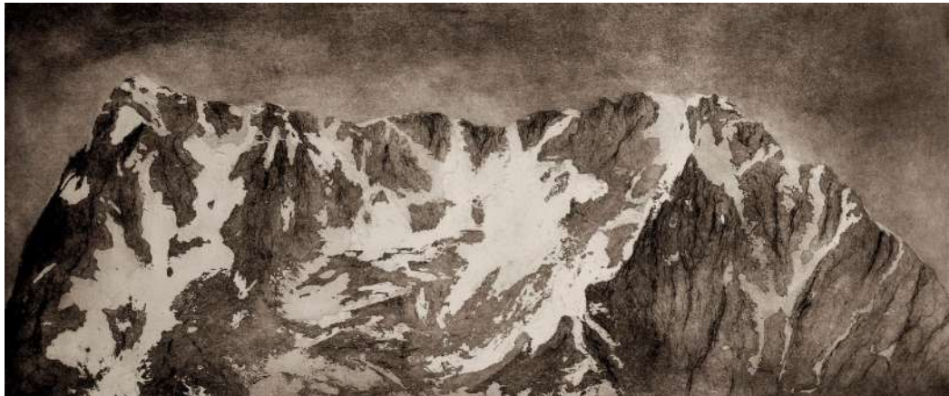
The North Face, Ben Nevis, Etching, Unframed, £250