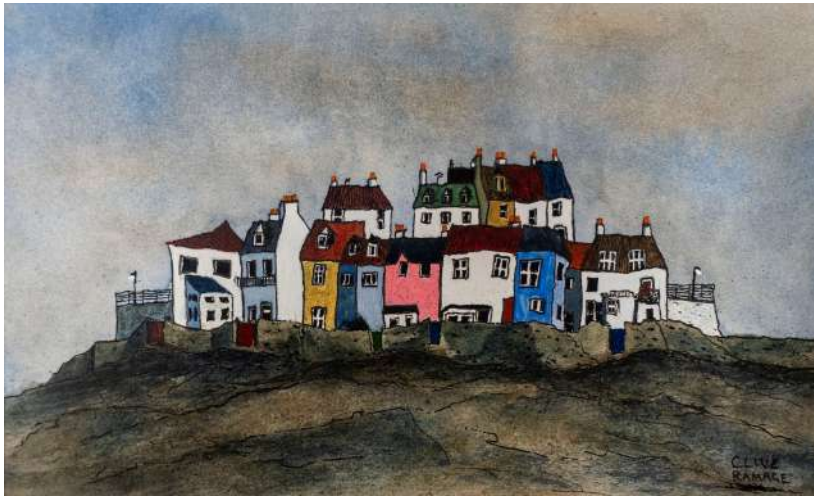
East Neuk 1, Hand coloured Etching, Framed, £425