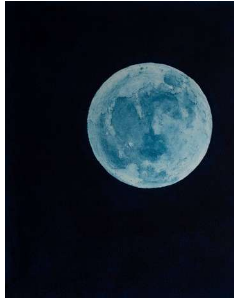
Blue Moon , Etching, Framed, £695