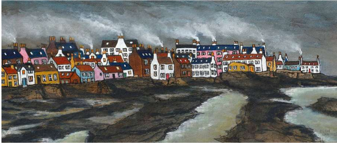
Cellardyke, Watercolour & Gouache, Framed, £495