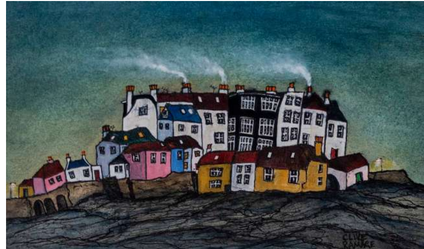
East Neuk 4, Hand coloured Etching, Framed, £425