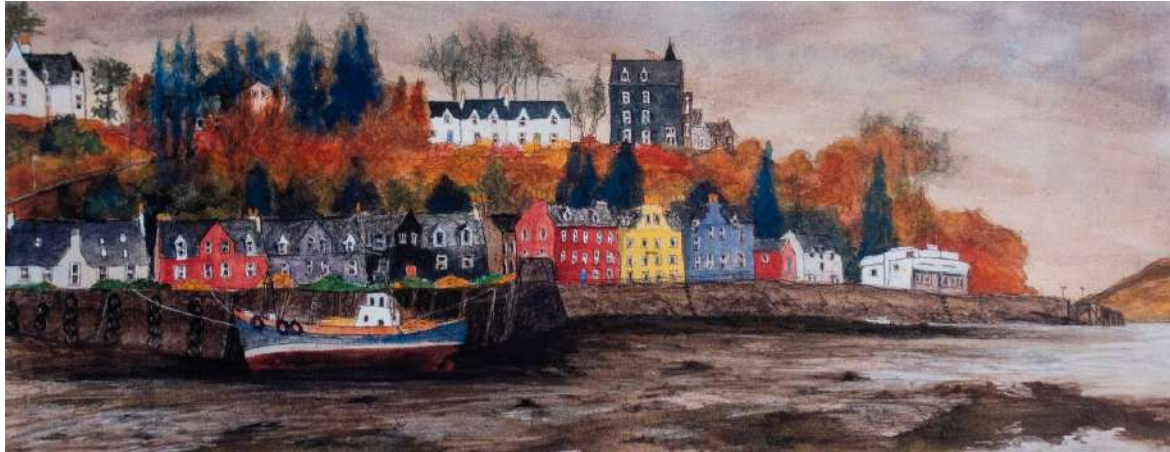
Tobermory, Hand coloured Etching, Framed, £850