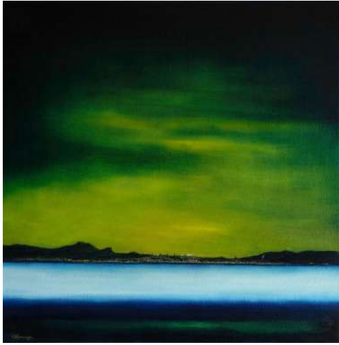
Edinburgh From Aberdour (Aurora), Oil on canvas, Framed, £1,250 SOLD