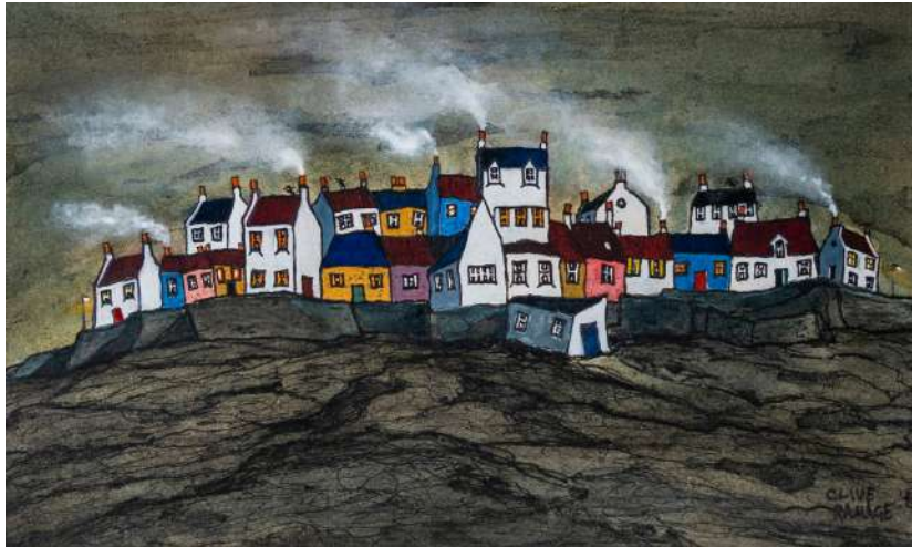
East Neuk 3, Hand coloured Etching, Framed, £425