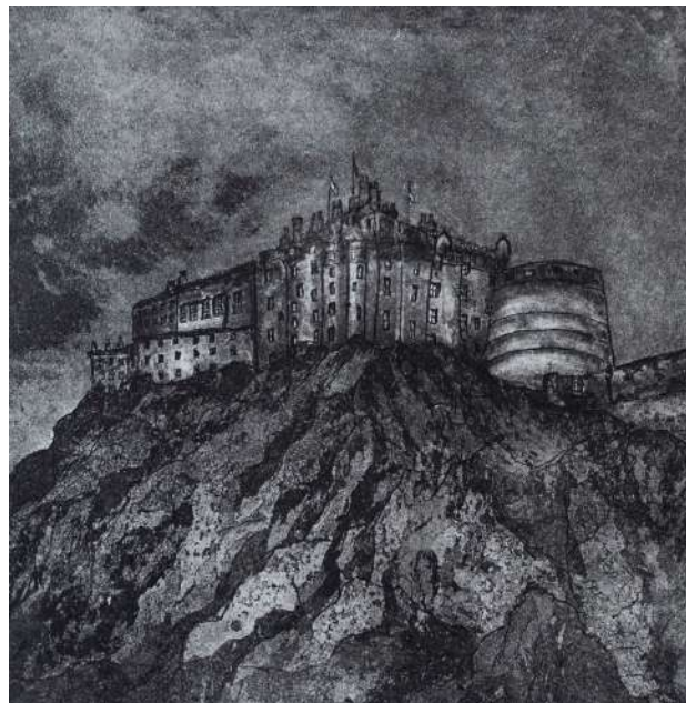
Edinburgh Castle, Etching, Unframed, £185