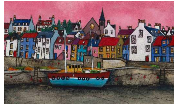
St Monans (Pink Sky), Hand coloured Etching, Framed, £450