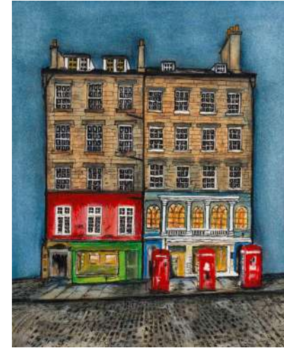
The Royal Mile, Hand coloured Etching, Framed, £495