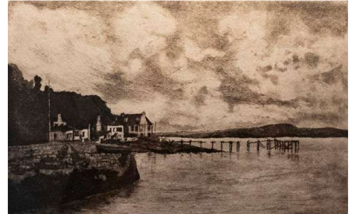
The Old Pier, Aberdour, Etching, Unframed, £200