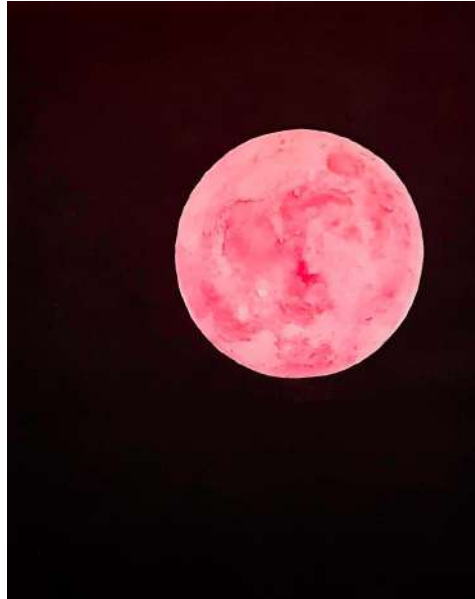
Blood Moon, Etching, £595